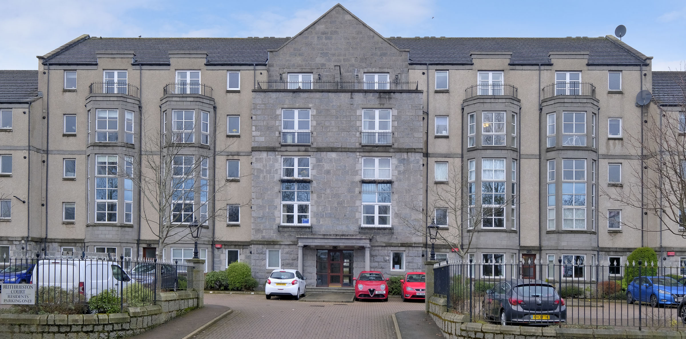
10 Ruthrieston Court Riverside Drive, AB10 7QF